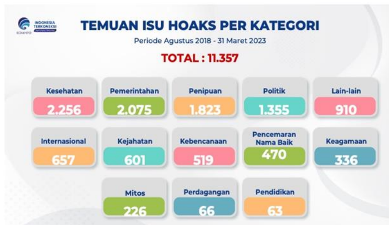
Figure 2. The Categories of Hoax Issues Resulted from the Ministry of Communication and Information's Automatic Identification System (AIS) Processing (Period of August 2018 - March 31, 2023) ( https://www.kominfo.go.id.2023 )

As reported by Masyarakat Anti Fitnah Indonesia (Mafindo), there has been a shift in hoaxes and fake news from the 2019 to 2024 elections. If, in the 2019 elections, text and images were the weapons of hoaxes and fake news, now approaching the 2024 elections, video hoaxes and fake news