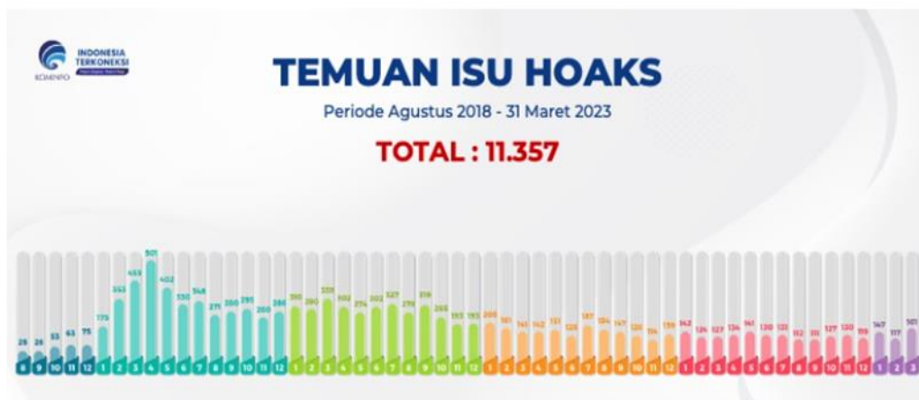
Figure 1. Hoax Issue Findings Resulted from the Ministry of Communication and Information's Automatic Identification System (AIS) Processing (Period of August 2018 - March 31, 2023) ( https://www.kominfo.go.id.2023 )

with 2,256 items. Followed by the government (2,075), which manages the Covid-19 pandemic. Political hoaxes are in fourth position with 1,355 items. Usually, political hoaxes are closely correlated with religious issues, with 336 items. The correlation between politics and religion can be understood because most of Indonesia's population is religious. Therefore, it is normal for religion to be a 'sexy' issue to be exploited in discourse battles. During the first quarter of 2023, Kemenkominfo identified 425 hoax issues circulating on websites and digital platforms. This number is higher than in the first quarter of 2023, which reached 393 hoax issues ( https://www.kominfo.go.id.2023 ).