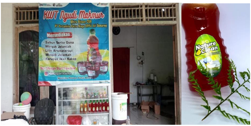
Figure 3. A store selling multipurpose soap and multipurpose soap products