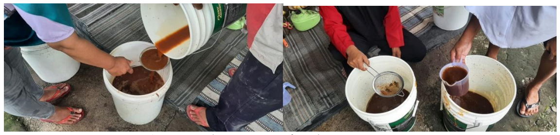
Figure 1. The process of making Eco Enzyme

Used cooking oil can be used through a purification process to be reused as a raw material for oil-based products such as soap (Naomi et al., 2013). Soap is a surfactant used with water to wash and clean stains. When applied to a surface, soapy water effectively binds particles in suspension, easily carried by clean water. Soap is produced from the hydrolysis of oil or fat into free fatty acids and glycerol, followed by saponification (Fessenden & Fessenden, 1997).