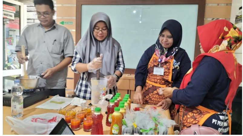
Figure 2. The process of making soap is versatile